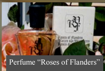
Perfume "Roses of Flanders"